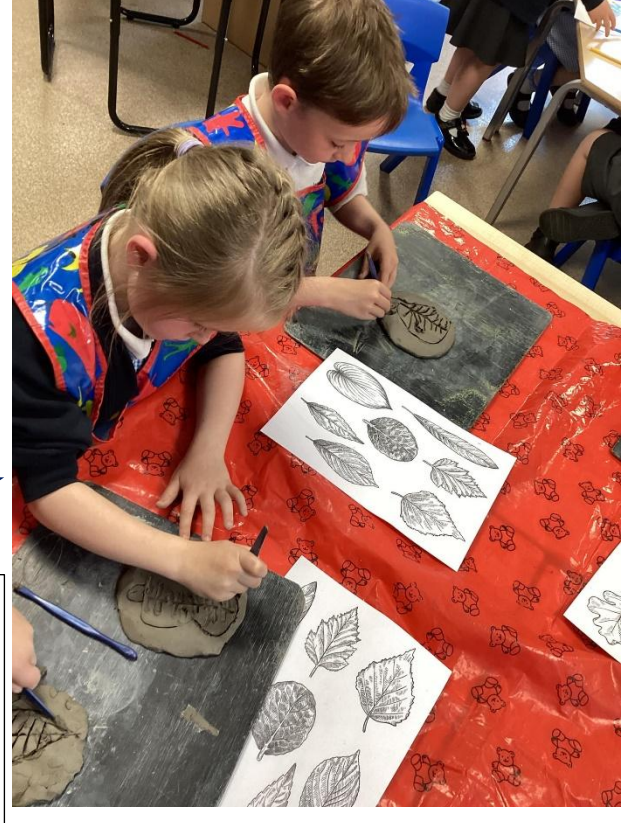
Such intricate work for our budding artists and sculptors in Year 1.