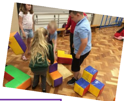
Blakehill hosts a Maths problem-solving day for children in Year 3 and 4 from schools across the Bradford district.