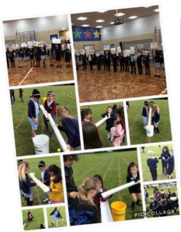
Year 3 Linking Schools Project. Blakehill children working with pupils at Westbourne Primary to develop their team-building and communication skills.