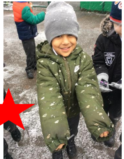
1W taking full advantage of the snowy weather.