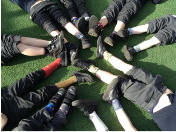
Odd socks day in Reception celebrating our very own uniqueness.