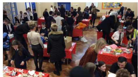
What a creative afternoon Year 5 and 6 pupils and their parents had this week making mine carts and fairground rides.