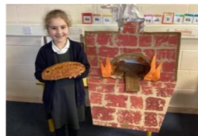
Year 2 Developing breadmaking skills as part of the Great Fire of London project.