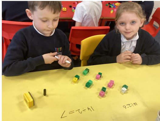
Working together to practise division – just how maths should be; fun and practical!