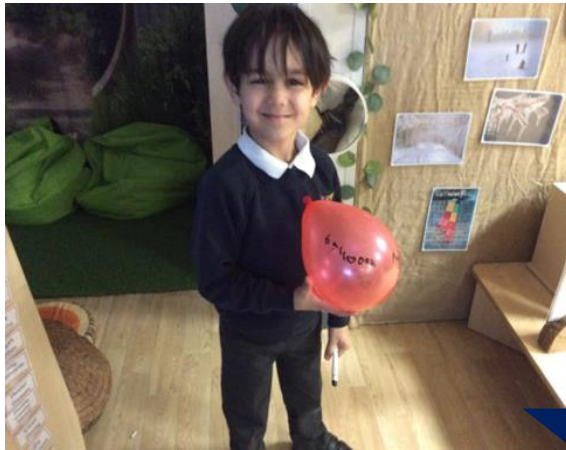
Ooo just look at that. The oo digraph on balloons. Great learning Reception.