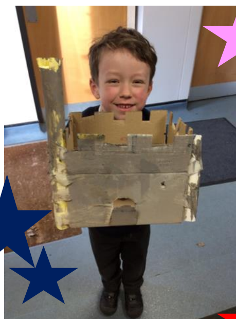
Year 1 loved designing and making castles after their visit to Skipton Castle – some even had a draw bridge!