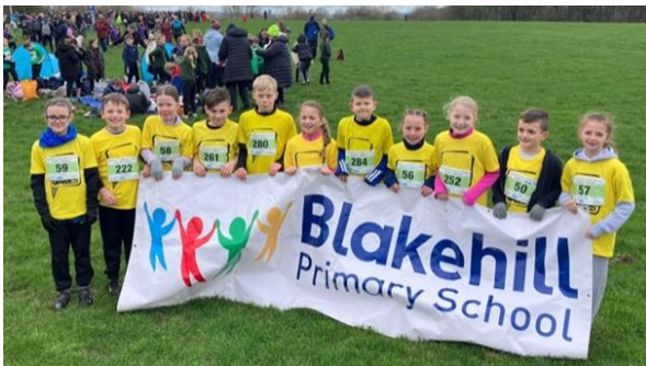
Blakehill's cross country participants at Temple Newsam yesterday.