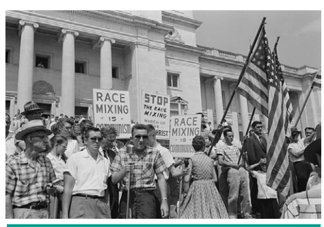
A protest against desegregation, 1959

Before 1954, black children and white children in the USA had to go to separate schools. In 1954, a Supreme Court ruling was made to desegregate schools. As a result, it became law for black and white children to be able to go to the same school. However, some parts of America, especially the southern states, resisted this law.