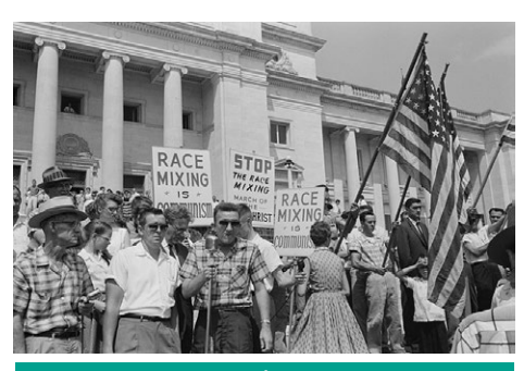
A protest against desegregation, 1959

In the USA up until 1954, black and white children had to go to separate schools — this was called segregation . In 1954, a US Supreme Court ruling was made to desegregate schools. As a result, it became law for black and white children to be able to go to the same school. However, some parts of America, especially the southern states (including Louisiana), resisted this law.