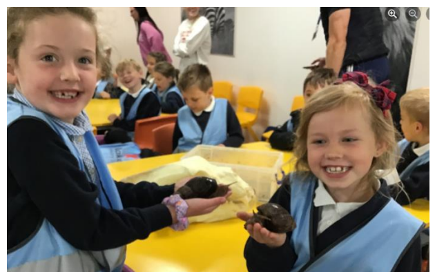
A picture that paints a thousand words....