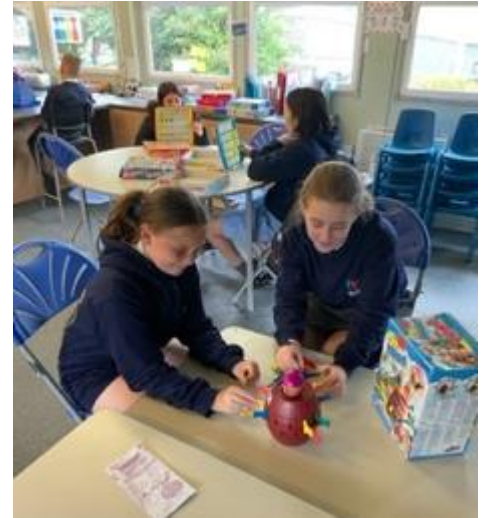
The lunchtime Tranquillity Club is a popular choice for the Year 5 and 6 pupils that enjoy participating in quiet activities with friends.