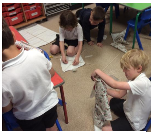
We know that it is tricky learning when your tongue comes out! New challenges help us to grow!