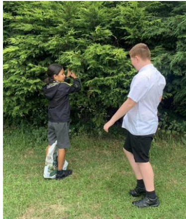
Prepared for battle - our Year 5 are a motley crew of Anglo-Saxon warriors. It's time to take cover!