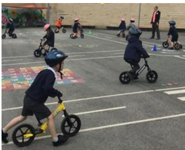
Great concentration, balance and resilience needed in Reception this week