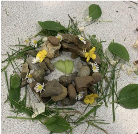
Year 6 pupils scavenging for natural resources in the school grounds for their Andy Goldsworthy creations.