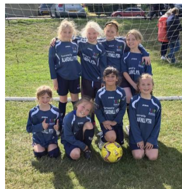
Our girls' football teams have enjoyed great success this year. Well done to those girls selected for the Bradford City trials this week. Go get 'em girls!