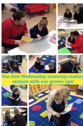
Parent reading buddies in Reception