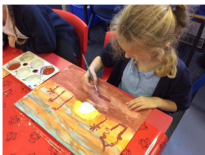
Painting African landscapes Year 2