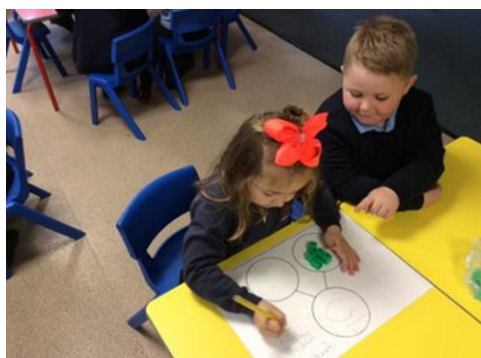
Marvellous Maths time in Year 1