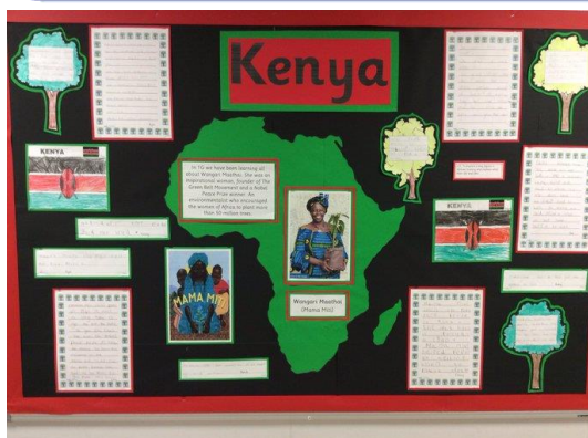
Year 1 work on Kenya

We place a great emphasis on enriching children's learning experiences across the curriculum at Blakehill, promoting opportunities that help our children develop the skills and knowledge they will need become life-long learners and responsible young people. Here are some example of this: