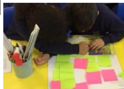
Sequencing the Creation Story