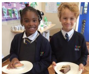
Autumn Term 2023