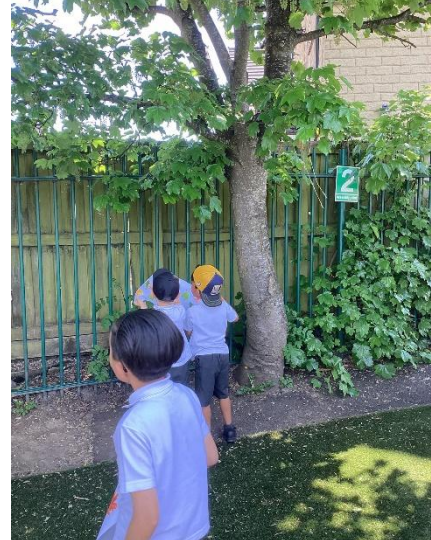
Year 1 love the great outdoors, especially when they are discovering more about the world around them! A leaf hunt is a great activity and keeps us busy, curious and enthusiastic!