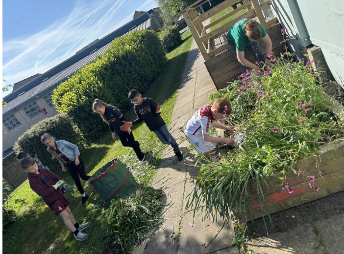
Thank you to children in Year 4 who are involved in the Grow to School project for tending to our school planters. We cannot wait to see the first shoots of our vegetable crop.