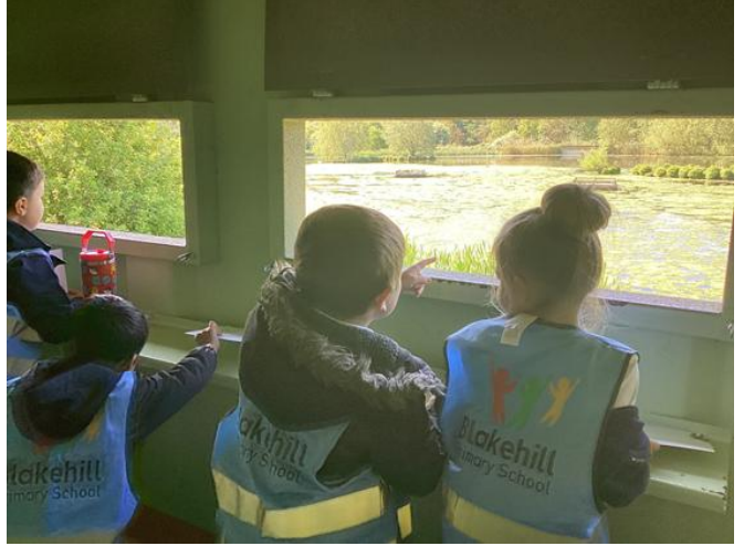
A visit to Rodley Nature Reserve is a great way to spot different species in their natural habitats.