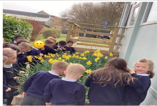
Outdoor art lessons.