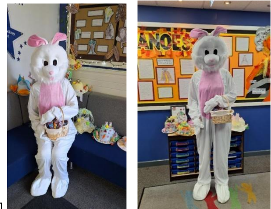
There was a very special guest in school