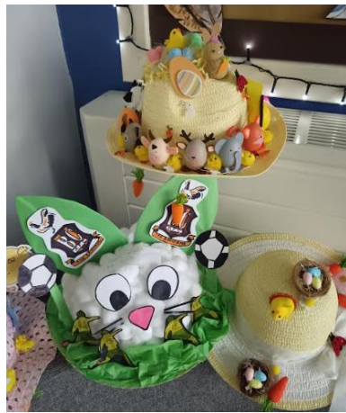
We had a great response to the PTFA Easter bonnet competition