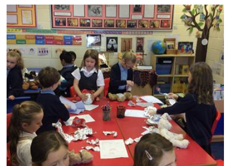
Year 2 investigating which materials are suitable for making waterproof hats for our teddies.