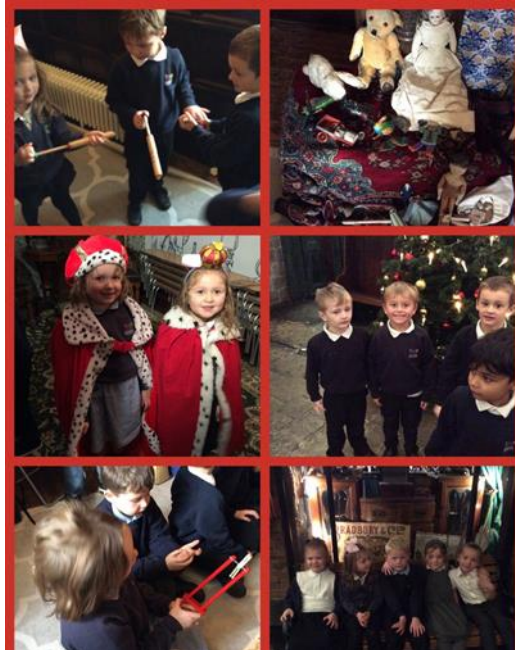
Year 1 visit to Abbey House Museum - comparing old/new toys