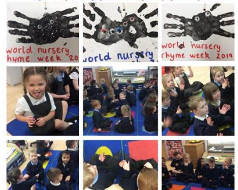
We celebrated world nursery rhyme week. We sang hickory dickory dock down in the jungle and row row row your boat !