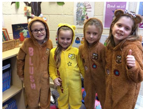
Celebrating Children in Need Day!