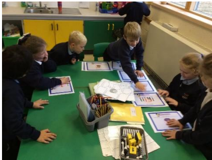
Year 2 discussing ways to tackle bullying

We place a great emphasis on enriching children's learning experiences across the curriculum at Blakehill, promoting opportunities that help our children develop the skills and knowledge that they will need to become life-long learners and responsible young people. Here are some example of our children's learning during the last two weeks.