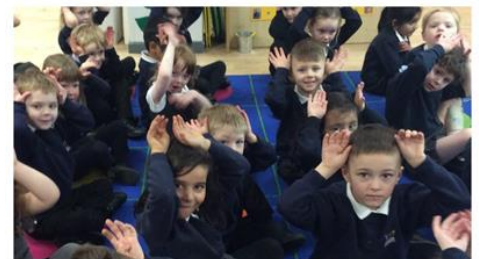
We got messy making spiders on incy wincy spider day!

Please see our school Twitter and our website for more photos