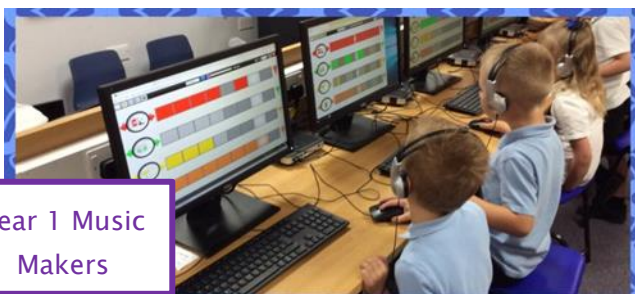
Year 1 Music Makers