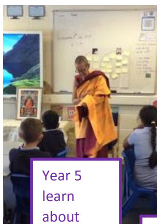
Year 5 learn about Buddhism