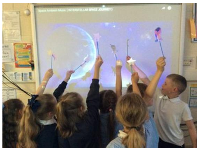
Investigating shadows in year 2 with our Space inspired shadow puppets