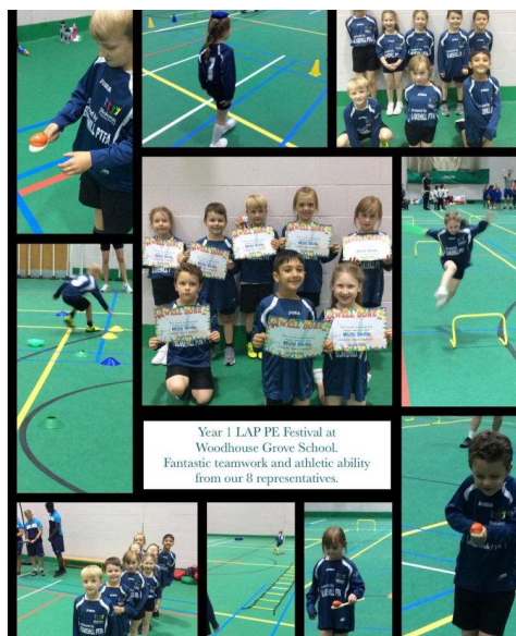
Year 1 LAP PE Festival at Woodhouse Grove School. Fantastic teamwork and athletic ability from our 8 representatives.

We place a great emphasis on enriching children's learning experiences across the curriculum at Blakehill, promoting opportunities that help our children develop the skills and knowledge they will need become life-long learners and responsible young people. Here are some example of our learning during the last couple of weeks.