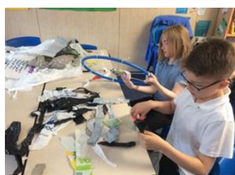
Exploring single use plastics in Year 4