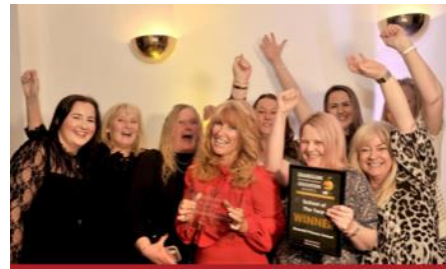
Staff from Blakehill Primary School with their School of the Year award.

Thank you to all parents, staff and friends of Blakehill for your nominations for this year's Telegraph and Argus School of the Year Award. We were humbled by the nominations and very overwhelmed to win the award which we feel reflects the strengths and collective effort of our school community. It is a great way of putting our school and most importantly, Blakehill children on the map! Thank you.