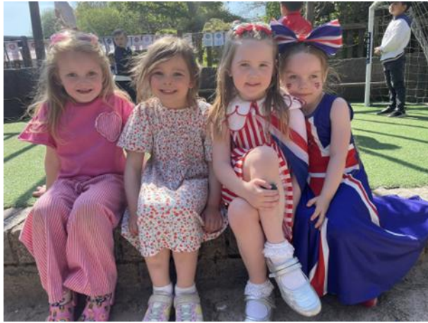
May Day 2026 A decorated bike and scooter procession followed by folk songs, maypole dancing and a picnic lunch – happy days!