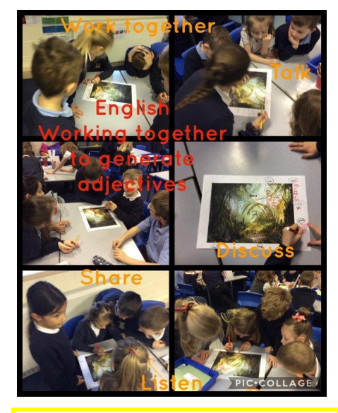
Year 3 English work-exploring adjectives