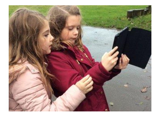
Year 2 identifying and recording human and physical features in Geography

We place a great emphasis on enriching children's learning experiences across the curriculum at Blakehill; promoting opportunities that help our children develop the skills and knowledge that they will need to become life-long learners and responsible young people. Here are some example of our children's learning during the last two weeks.